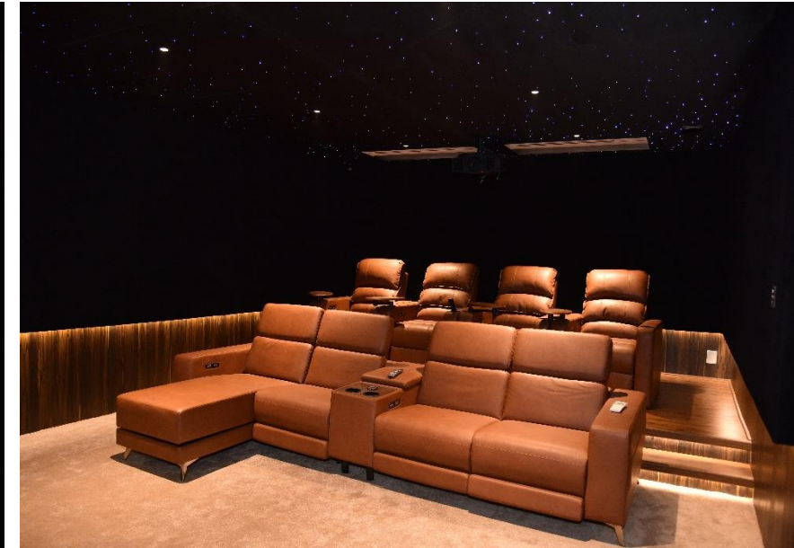
Mini Home theater