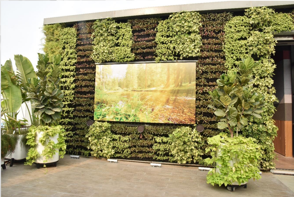
1.5 PP Outdoor Active LED (130")