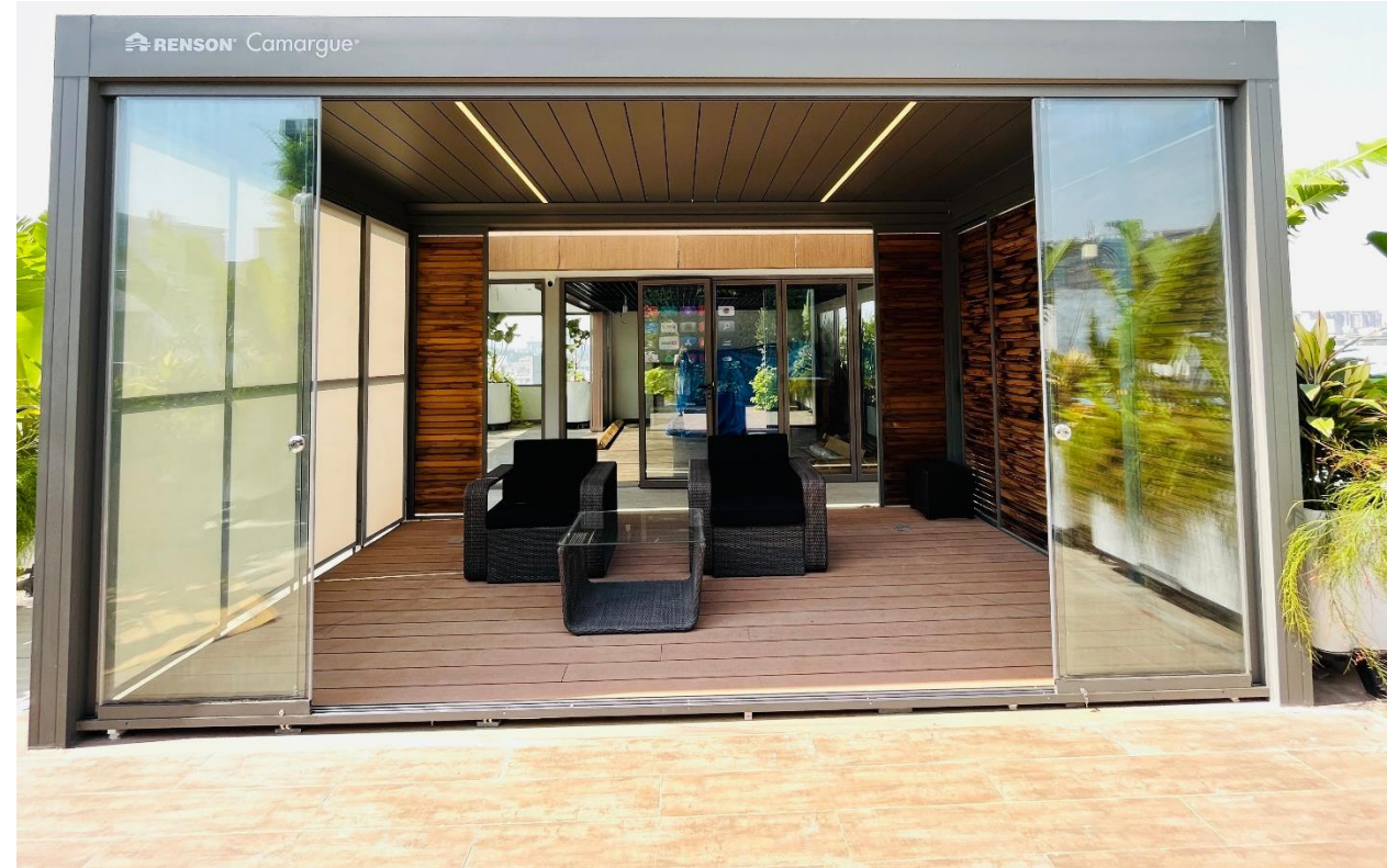
Renson Motorized Pergola (Belgium)